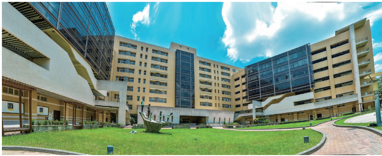
The building of College of Law and Politics in NCHU.